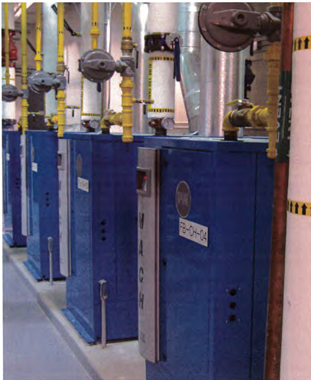
Patterson-Kelley, P-K MACH aluminum condensing boilers treated with TGWT’s tannin for more than three years, installed at a major hospital.