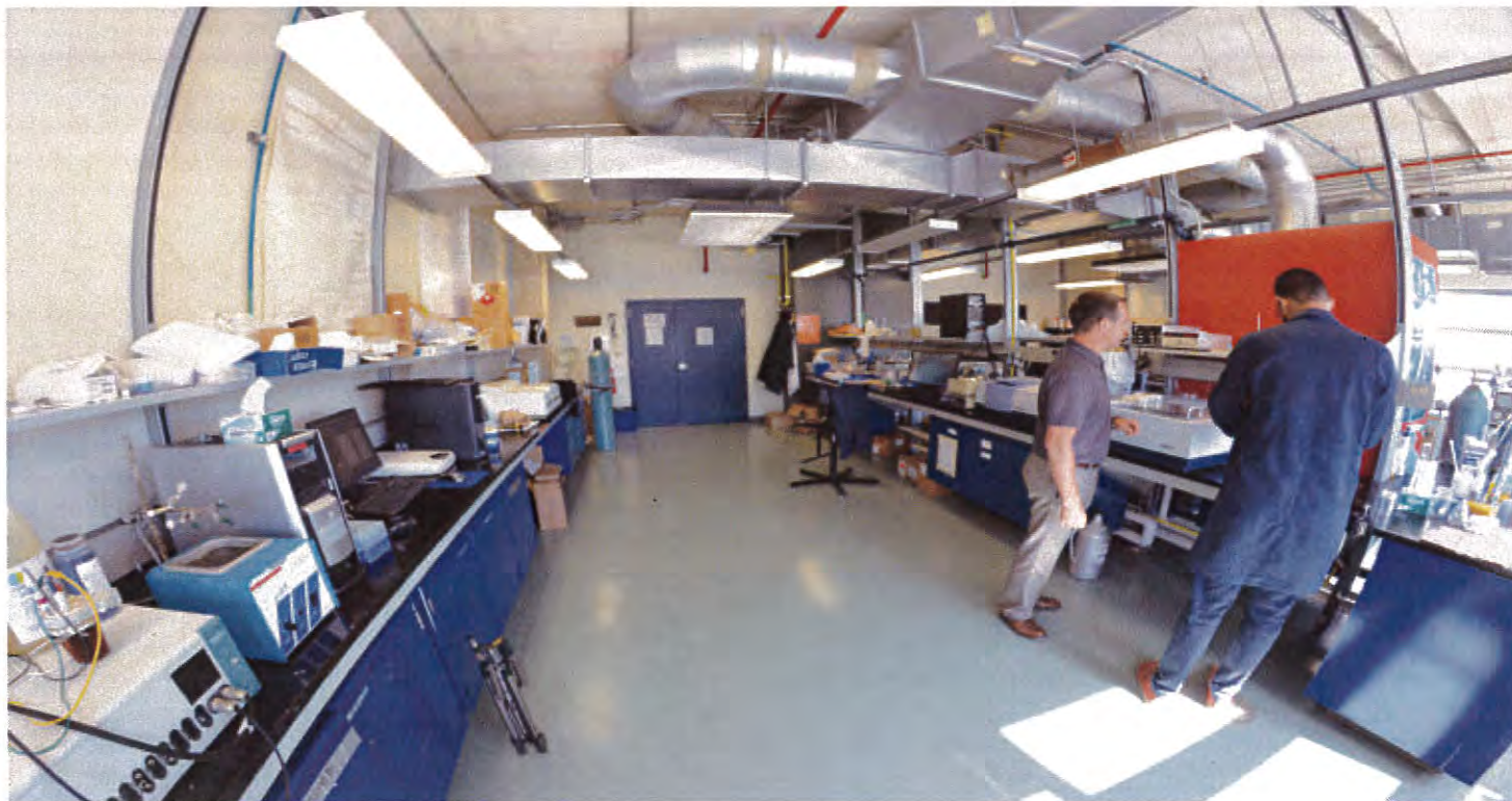
Electrochemical department equipment at McGill University used to run TGWT's study.

Purified tannins have a number of advantages over hard chemicals. They are renewable, non-toxic, non-flammable, and biodegradable. In the boiler, they form a dynamic, homogenous, iron- and/or aluminum-tannate(s) film protecting the metal surface from corrosion. Non-purified tannins have been available since the 19th century, but natu-